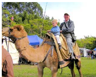
Norris on a camel and as the ‘Crocodile Hunter’