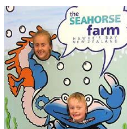
The Seahorse farm