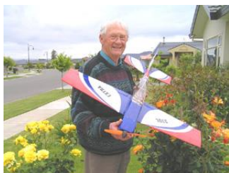
Norris & new Plane