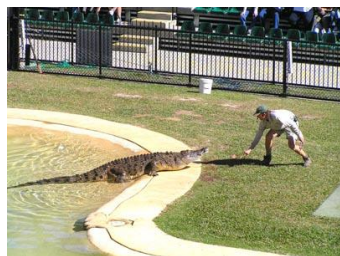
Steve Irwin's crocodile show