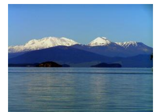
Ruapehu & Ngarauhoe