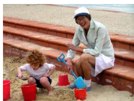
Holiday scenes In Australia