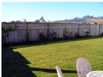
The garden before In Winter

we saw a wonderful Swedish film called "As it was in Heaven" Walking is now back on track now that Rita is fully recovered from her two weeks in hospital in September. Her blood thinning Warfarin went out of control and with brain bleeding followed by pneumonia in hospital gave us an anxious time but now all things are well again. Lying in hospital looking at sky gave Rita the idea that our back fence was too obstructive and so began several weeks work of removal, concreting, fencing, painting and re-planting the garden after much trampling on it. However the result was well worth while and now we have a lovely view of the Reserve land outside our back fence. (The insight of a woman- the hard work of a man!)