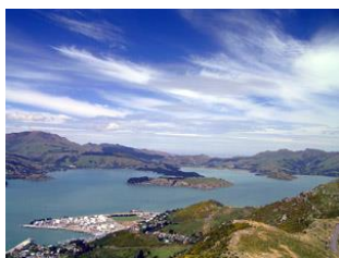
Christchurch Lyttelton Harbour

local field. They are now headed to Christchurch and then to Australia, Since our last letter we too have been to Christchurch and had a lovely time in this very picturesque English type city. Punting on the Avon, the Antarctic centre, the Port hills and Gondola and the old