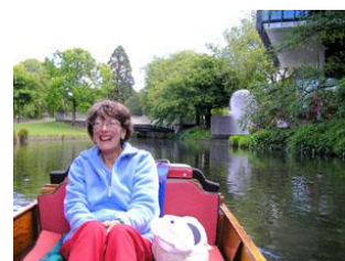
Rita on the Avon

As usual we continue with all our activities. Our Probus Club is in its 10 th year & we plan special activities for it. We are still avid film goers and often see the Art Films, French & Italian festivals and all the films that seem to be made for the 'Colonies' out here with famous British actors that never hit the commercial cinemas. Recently