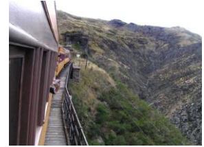
The Taieri Gorge Railway