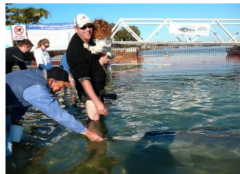
Feeding the dolphins