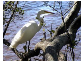
An egret by the river