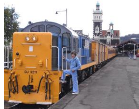
Boarding the train