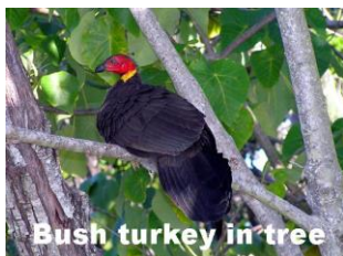
Bush turkey in tree