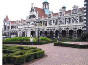
The railway station