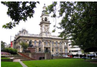
Town hall & Robbie Burns