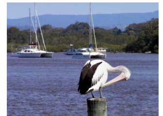
A pelican preening.