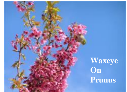
Waxeye On Prunus