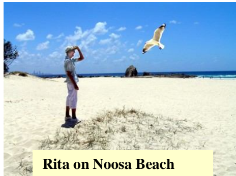
Rita on Noosa Beach