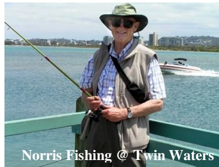
Norris Fishing @ Twin Waters