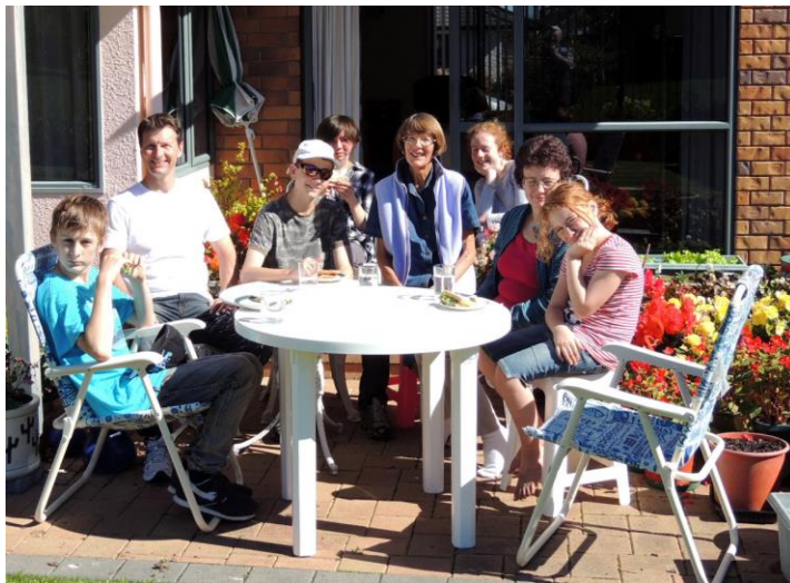
The Family with us at Easter 2012