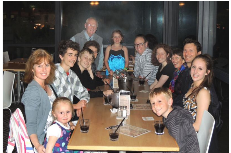
Our Golden Wedding Dinner July 2012

The newsletter has been delayed (an age thing as it takes longer to do things-especially gardening) and I hope it arrives for Christmas. We have been blessed with a fabulous journey to bring us so far with so many wonderful friends and family and I may not have mentioned this before but I can only thank our parents in the way they cared for us, taught us and laid the foundations for our lives.