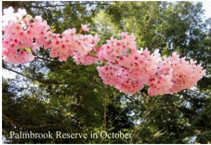
Palmbrook Reserve in October