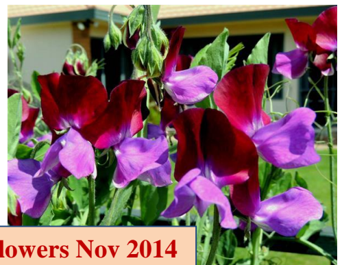
Flowers Nov 2014