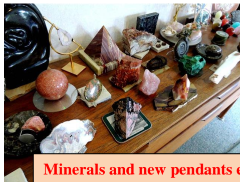
Minerals and new pendants etc.