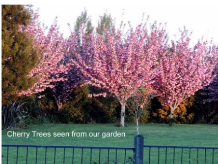
Cherry Trees seen from our garden