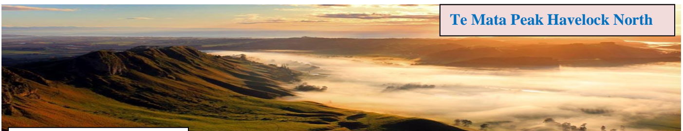
Te Mata Peak Havelock North

So there we are. We have had a lovely Spring and the flowers and Cherry blossoms have exceeded themselves this year. Late Spring has been hot with just enough rain to keep the grass green. We picked daffodils with the family in the beautiful Taniwha daffodil fields in Waipukurau and look forward to seeing all the family over Christmastime. So we send you best wishes for Christmas and the New Year.