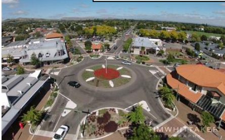
Havelock North Village; The new Domain ; Summerset village

Our village is certainly changing too with a new 5 star hotel being built and an upgrade to the domain.