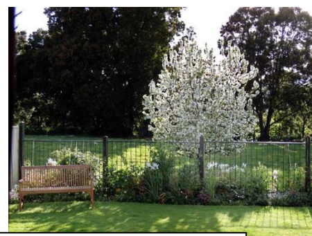
Catamaran sailing at Twin Waters; Lorikeet feeding; Crab apple blossom in garden