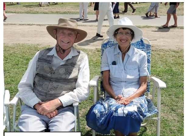
Art Deco 2018