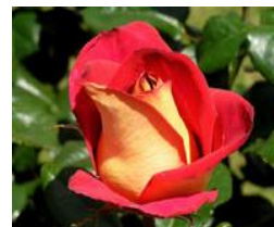
Gift Basket Rose