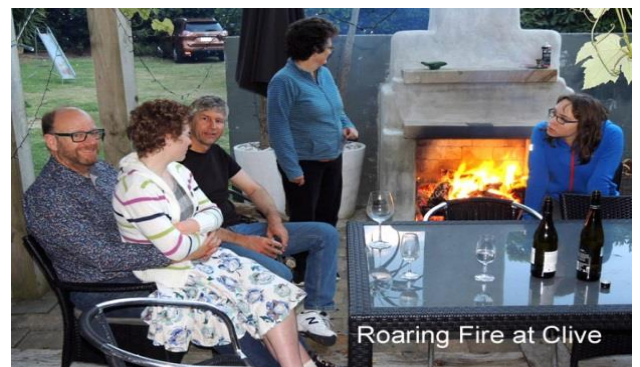
Roaring Fire at Clive