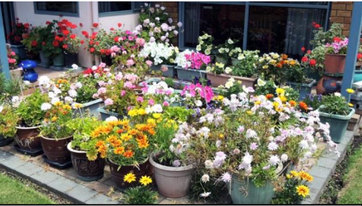
The garden in November 2017